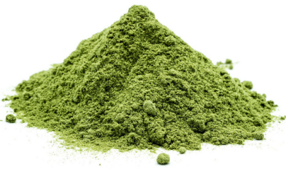
Barley Grass Powder