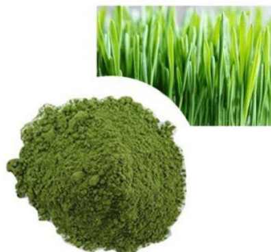
Oat Grass Powder