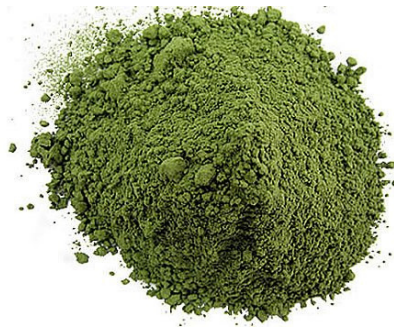
Wheat Grass Powder