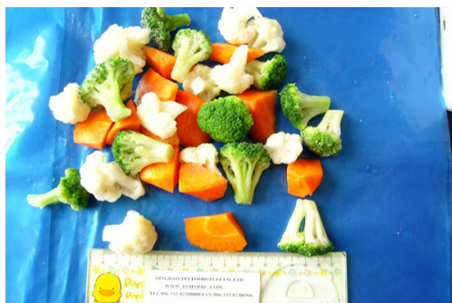
Mixed Carrot and Broccoli